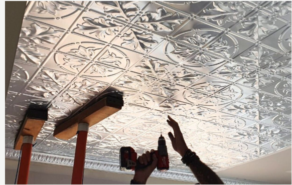
Above example: Using multiple ceiling props to assist while pop riveting