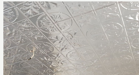
Above example: Installed ceiling prior to painting