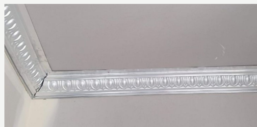
Above Example: Ceiling with cornice installed first