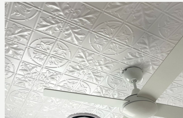
Completed ceiling featuring 'Large Maple' design