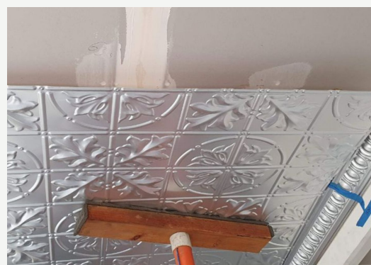
Above Example: One panel installed with ceiling prop holding in place