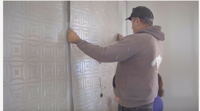
Above example: Installing panels